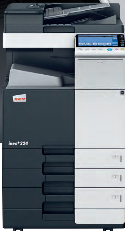
ineo+ 224 with paper feeder (PC-110) and dual scan document feeder (DF-701)