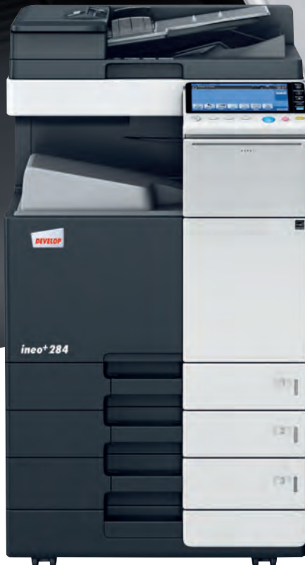
ineo+ 284 with paper feeder (PC-110) and dual scan document feeder (DF-701)