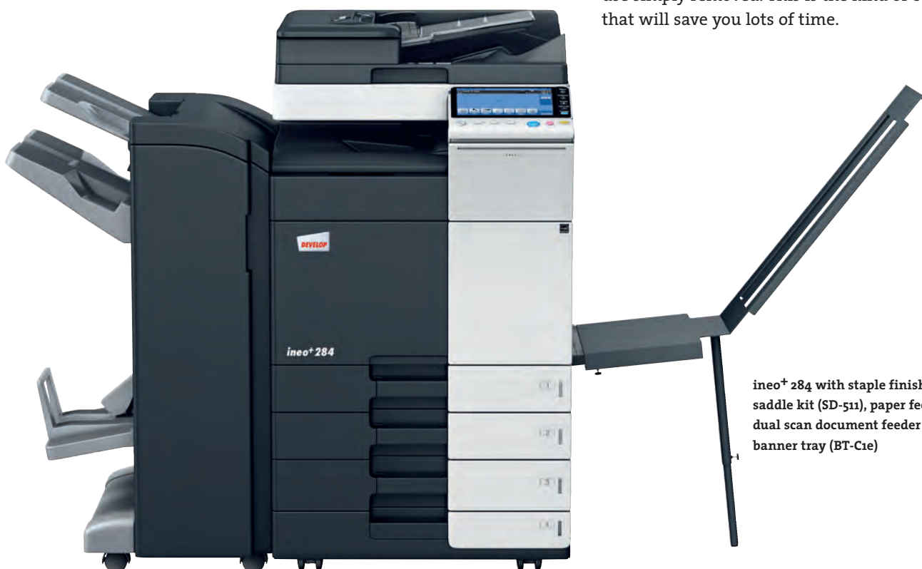
ineo+ 284 with staple finisher (FS-534), saddle kit (SD-511), paper feeder (PC-210), dual scan document feeder (DF-701), banner tray (BT-C1e)

Many multifunctional office systems are anything but user-friendly. The ineo+ 284, in contrast, is simplicity itself. An intuitive, easily understandable operating concept ensures that it is as easy to use as your smartphone or tablet. The 9-inch capacitive touchscreen comes with well-known functions such as flick&drag, and thanks to a new menu navigation structure you can see all functions in one go and select the settings you want with just a few clicks. Frequently used functions can be left on the start screen and ones you don't use simply removed. This is the kind of customisation that will save you lots of time.