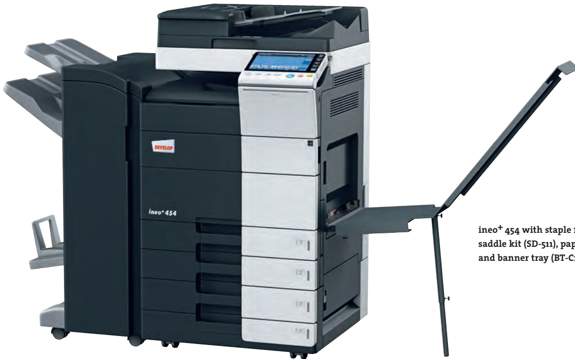
ineo+ 454 with staple finisher (FS-534), saddle kit (SD-511), paper feeder (PC-210) and banner tray (BT-C1e)