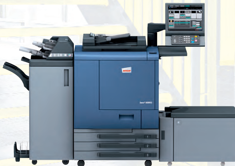
ineo+ 6000L with allround finisher (FS-612), post insertion unit (PI-502), document feeder (DF-622) and large capacity cassette (LU-202)

Thanks to a real resolution of 1,200 x 1,200 dpi x 8-bit, fully supported by the controller, the ineo+ 6000L delivers an unparalleled image quality that leaves competitors standing. In addition, several innovative functions ensure consistently outstanding print quality. The gradation correction function adapts to the varying characteristics of different media to save operators the time-consuming process of producing test patterns. If changes occur in the print environment and the engine, the exclusive CRS (Colour Retention and Stability) technology makes the necessary adjustments to maintain optimal print quality. The short interval stability control monitors image consistency during continuous printing operations and automatically makes any corrections needed to ensure stable image quality. Moreover, automated colour management tools boost productivity through hands-free calibration, allowing operators to focus fully on producing more outstanding quality jobs in less time.