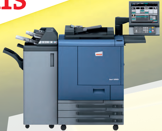
ineo+ 6000L with staple finisher (FS-531), post insertion unit (PI-502) and document feeder (DF-622)