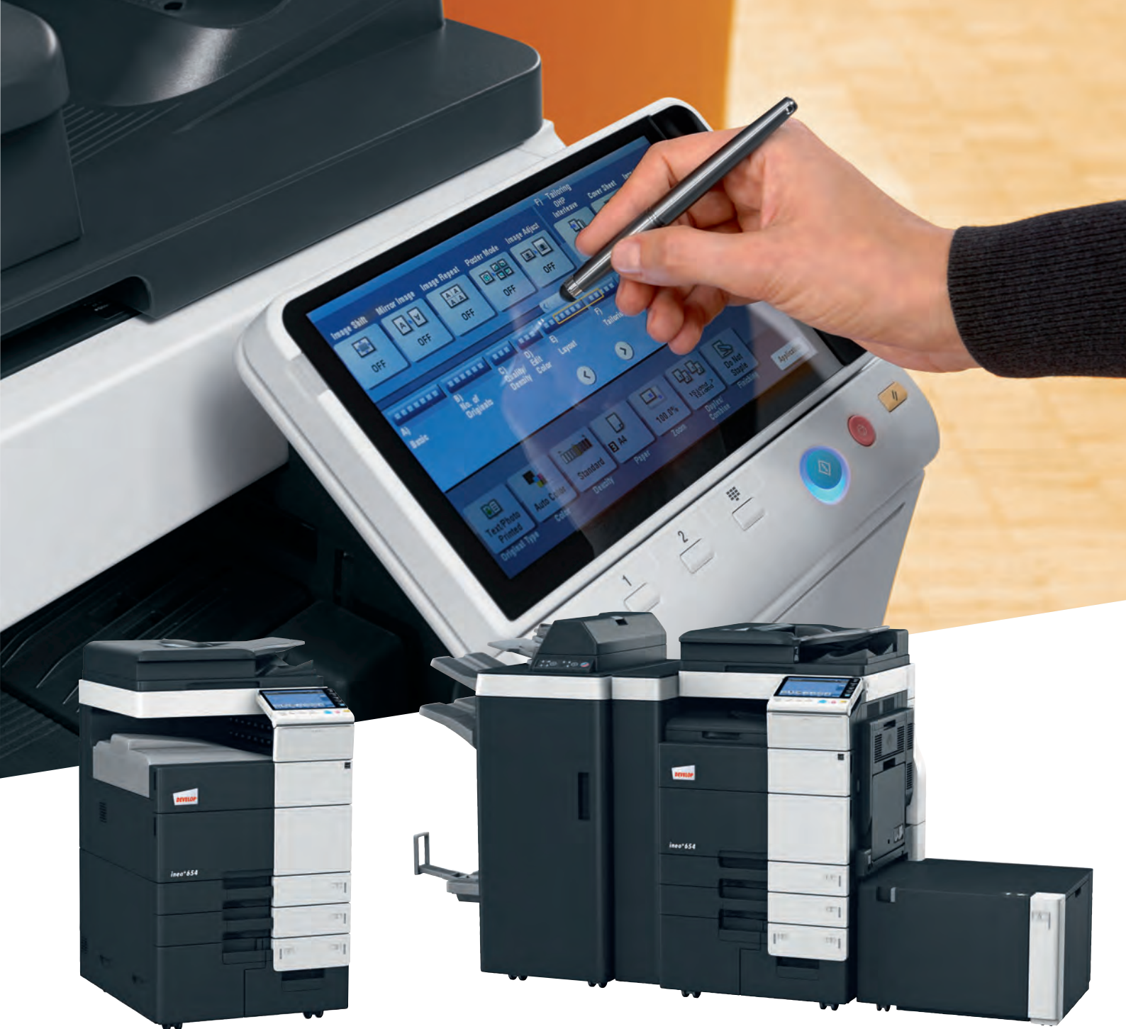
ineo+ 654 with output tray (OT-503)