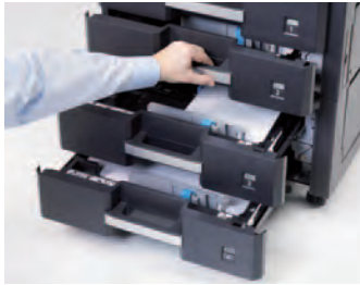
Flexible paper management

Equipped as standard with 2 x 500-sheet universal cassettes, duplex unit, original feeder, job separator and 160 GB hard disk