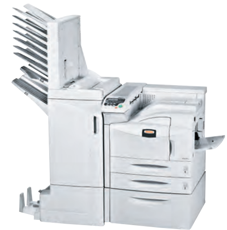
Image shows machine with optional accessories.

Specifications subject to change without notice.